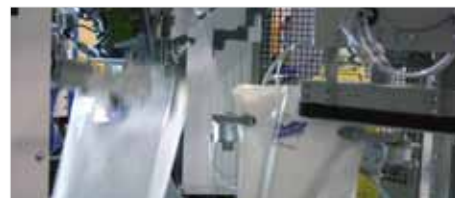
ANDY brings the bag to the closing system