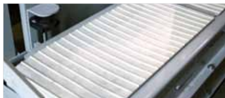
Conveyor raises to support the bag