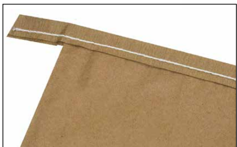
Model Shown with Filler Cord

The Fischbein Model 400 TNS™ is a tape over sew system designed for bagging applications up to 55 linear feet per minute. It is used to seal multi-wall paper and laminated woven polypropylene open mouth bags, producing an attractive crepe tape sewn bag closure. The Model 400 TNS™ automatically trims the top of the bag, applies the tape, sews the bag closed and lastly cuts the crepe tape and thread at the completion of each sewing cycle.